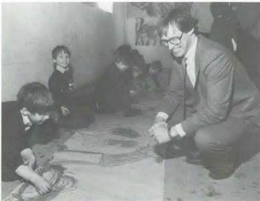
Queue for a view. The Hayward's Renoir .