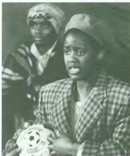
Theatre Centre's Under Exposure at the Theatre in Education conference.

conferences during 1984/85. Theatre in Education: a national conference was a three-day meeting at Warwick University, bringing together over 150 theatre practitioners working for young people, local education authority representatives and funding bodies (see Drama report).