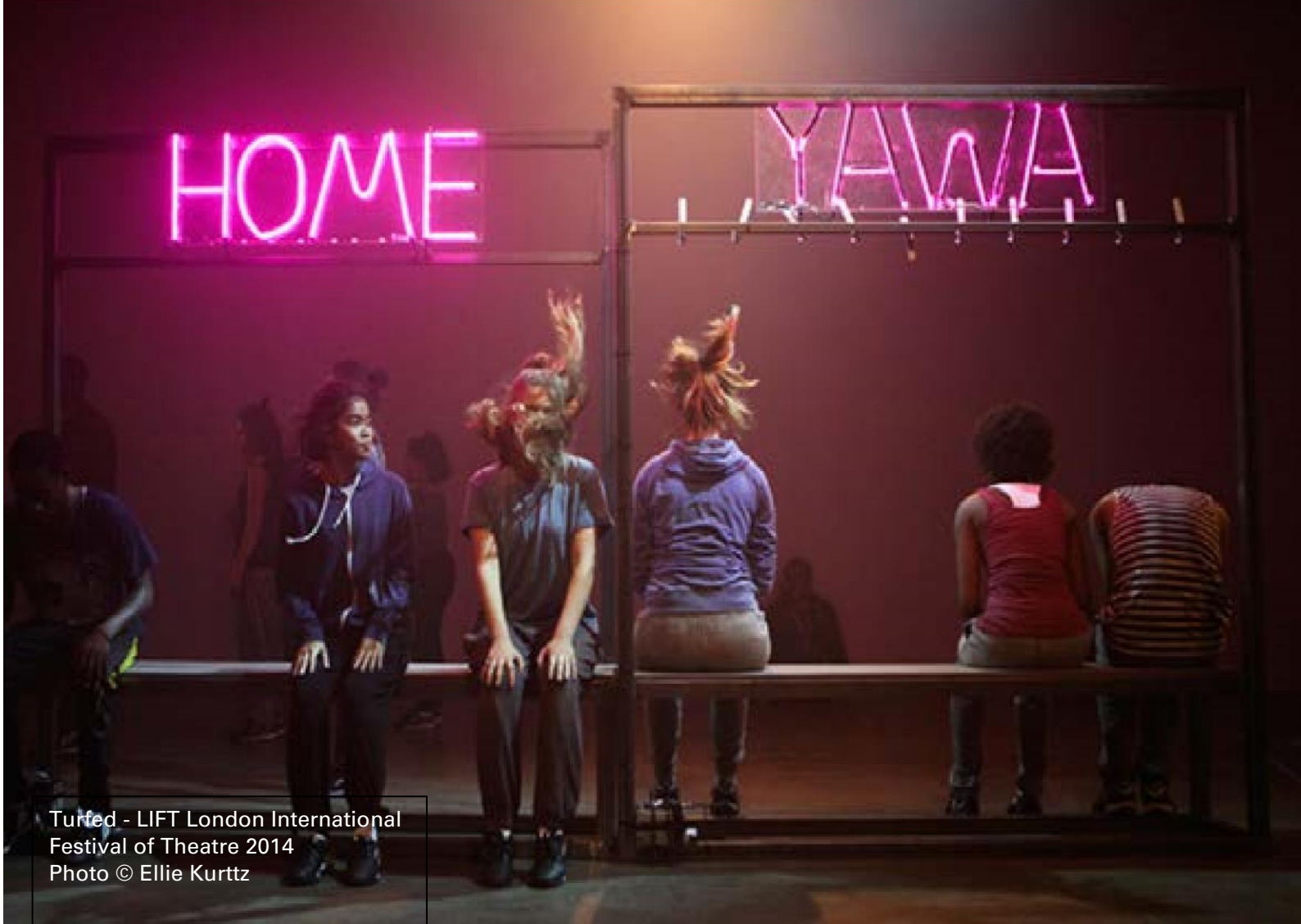
Tufted - LIFT London International Festival of Theatre 2014