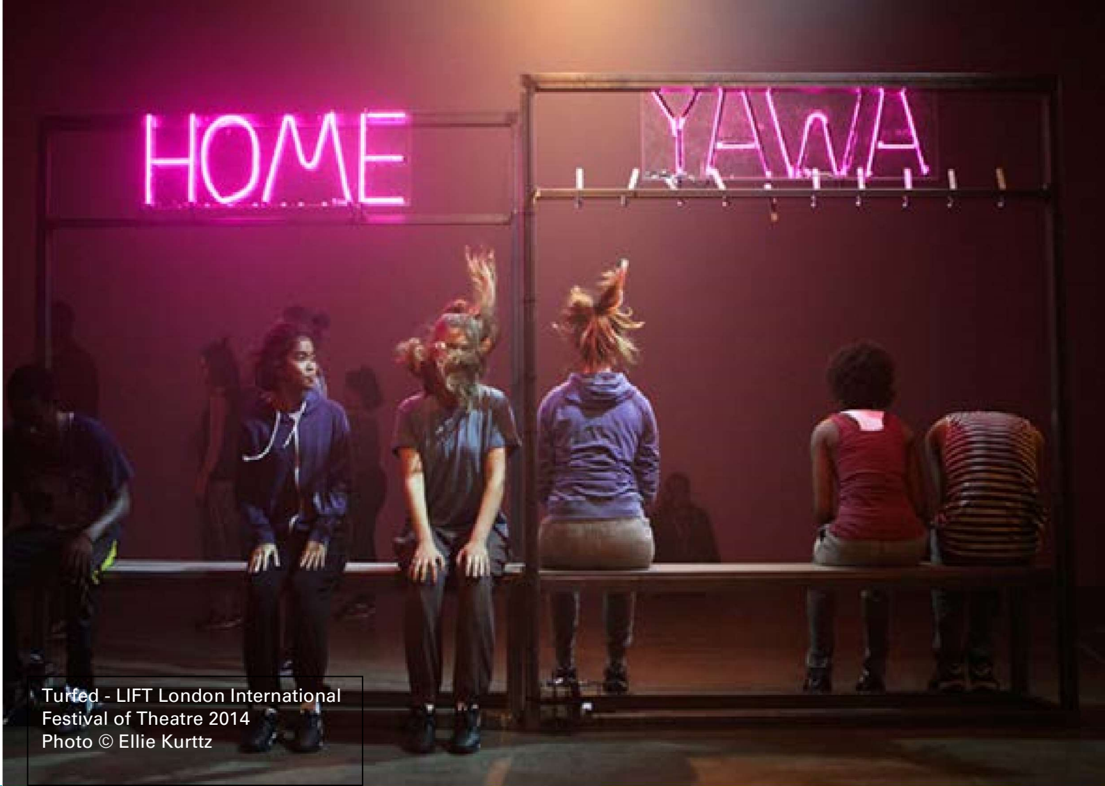
Tufted - LIFT London International Festival of Theatre 2014