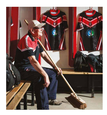
Heart of Glass: For the love