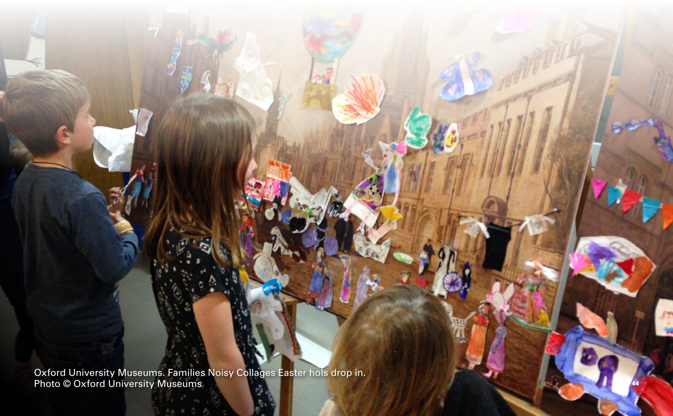
Oxford University Museums. Families Noisy Collages Easter hols drop in.