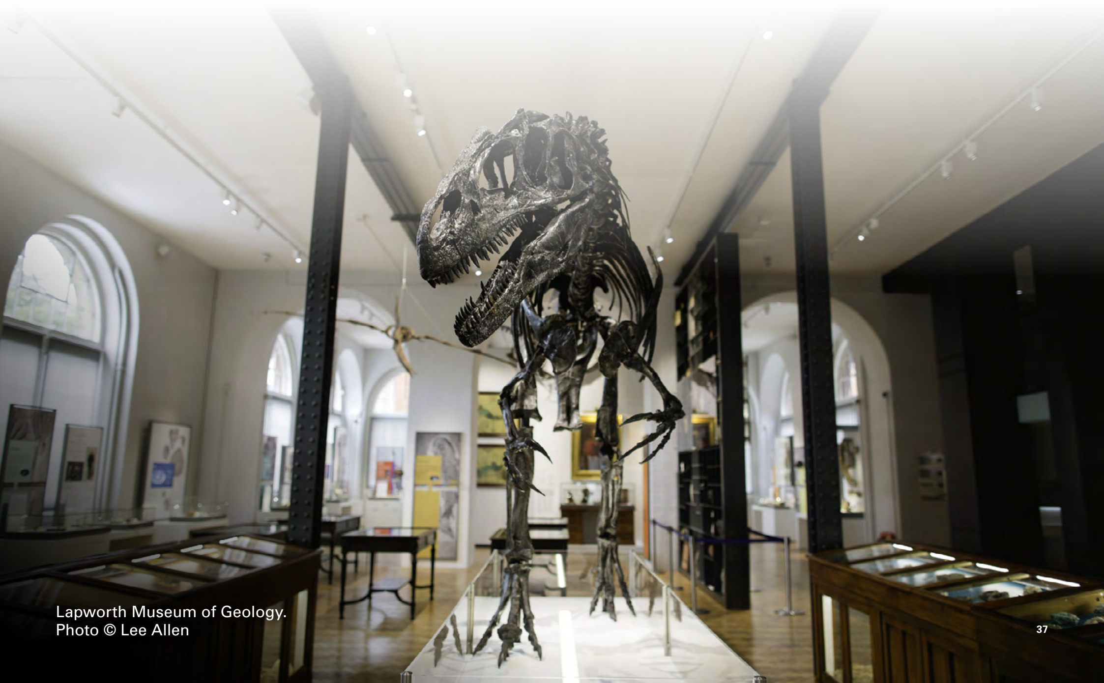
Lapworth Museum of Geology.