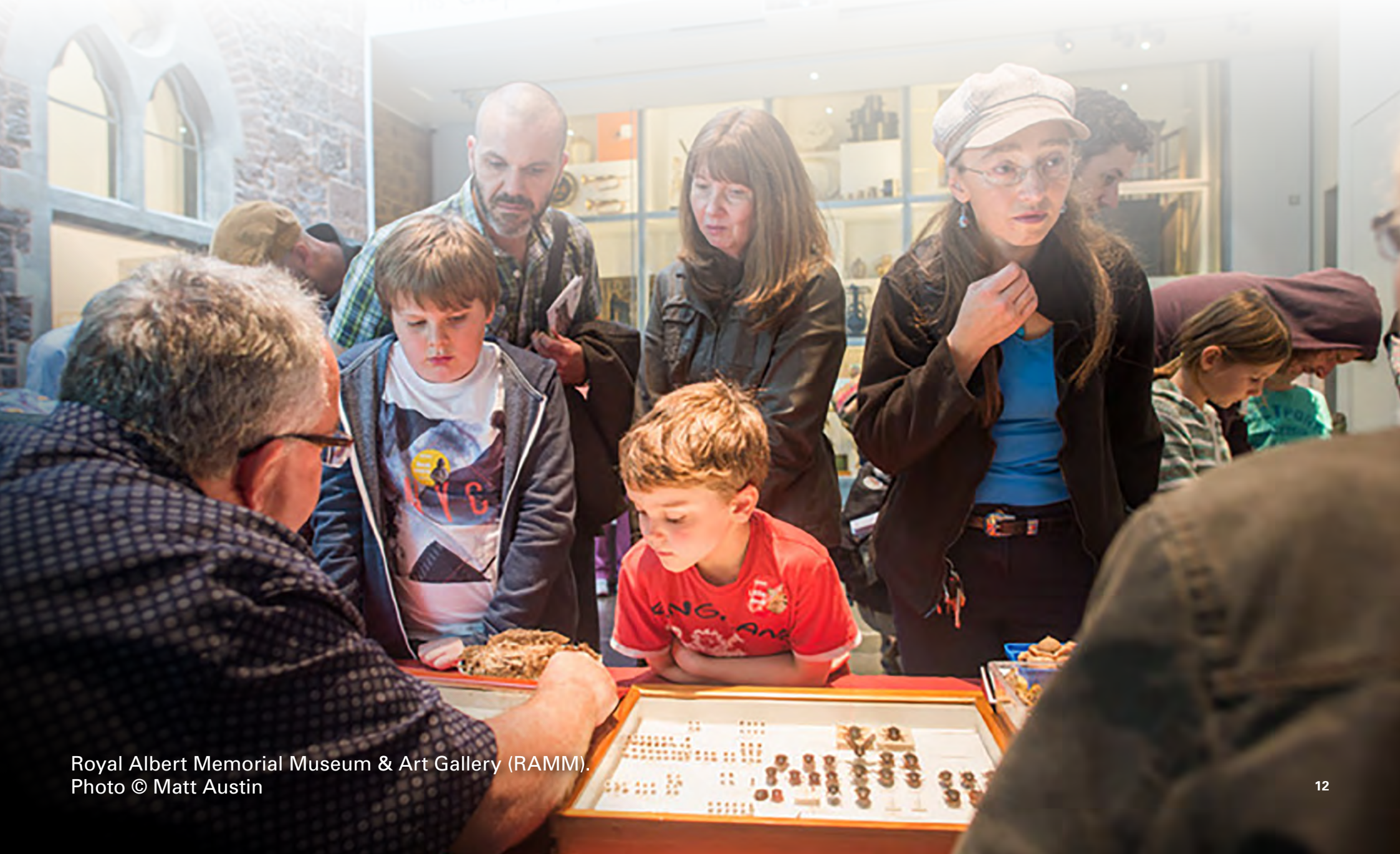
Royal Albert Memorial Museum & Art Gallery (RAMM).