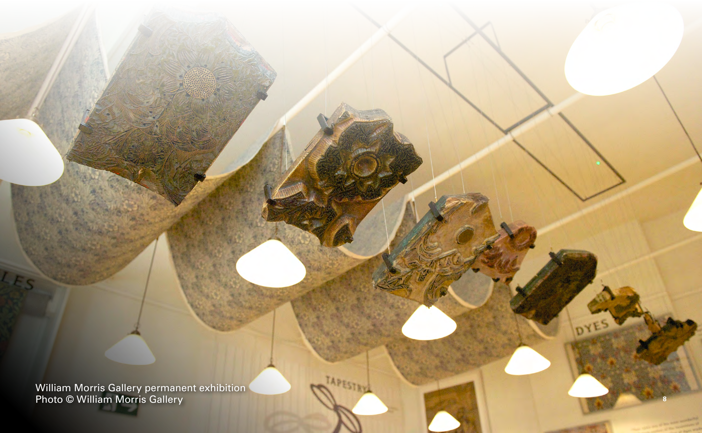
William Morris Gallery permanent exhibition