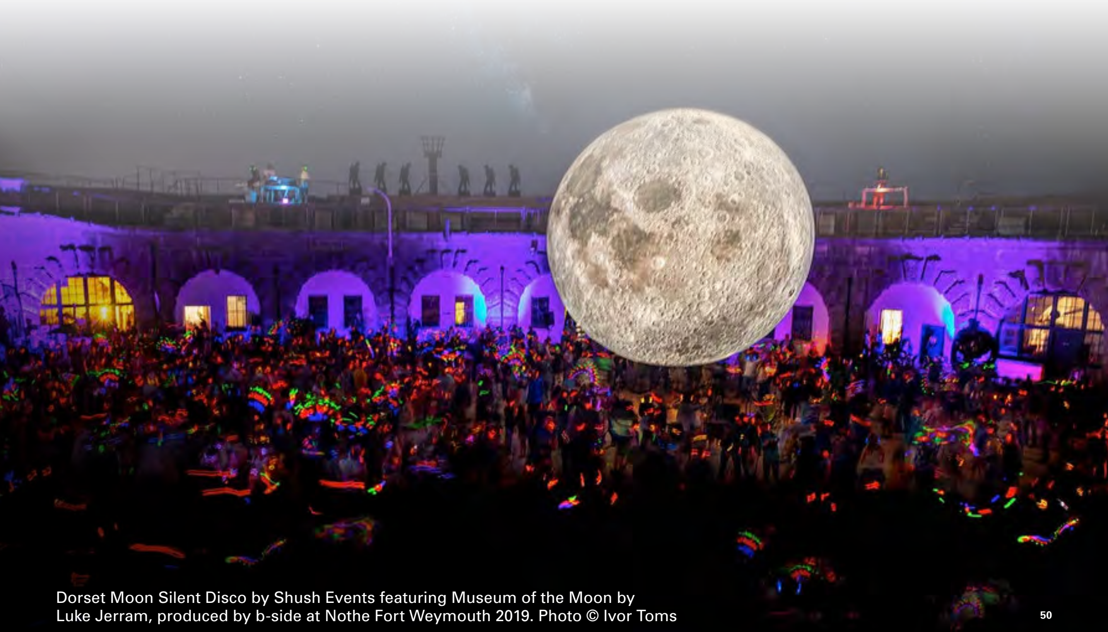
Dorset Moon Silent Disco by Shush Events featuring Museum of the Moon by Luke Jerram, produced by b-side at Nothe Fort Weymouth 2019.