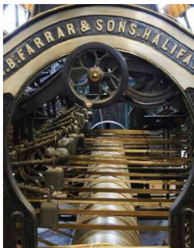
Spinning machinery.