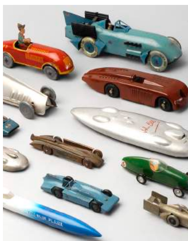
Land speed record toys, National Motor Museum.

Designation recognises the importance of the whole of the collection which acts as a benchmark for scholars and a fascinating insight into Tudor life.