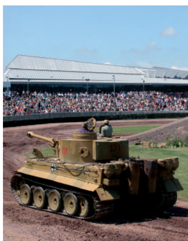
Tiger Tank 131, Tank Museum.

Today the ss Great Britain Trust Collection, based in the Brunel Institute alongside the ss Great Britain, is central to the study of three major national and international themes: the development of Victorian maritime technology and the rise of the British mercantile marine; the history of nineteenth century emigration; and particularly the work of Isambard Kingdom Brunel.