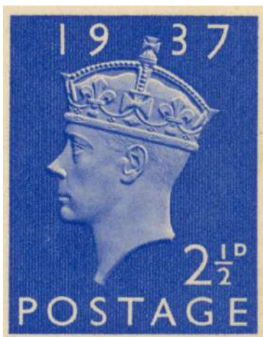
Proposed coronation stamp of Edward VIII, never issued, 1936.

The Designated collection includes employment records and staff magazines, business records, Postmaster General's papers, wartime history records and original stamp artwork. The collection is outstanding in terms of its evidential, historical and cultural value, and represents comprehensive and complete coverage of the role the Post Office has played in employment history, overseas expansion, communications and community cohesion.