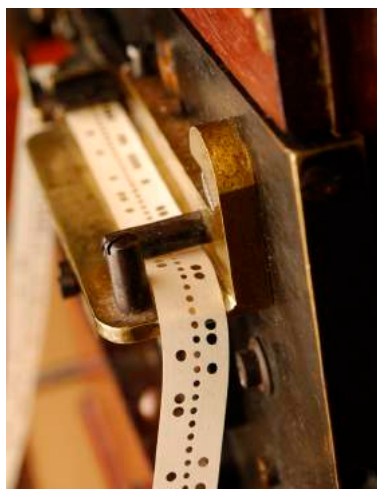
Morse code punched on slip.