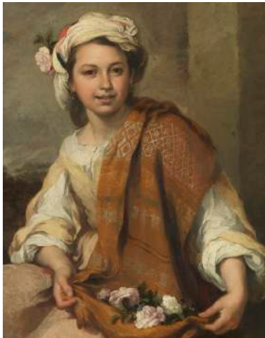
Girl at a Window by Rembrandt.

The collection of Impressionist and Post-Impressionist paintings, assembled by Samuel Courtauld, is especially famous, as are the drawing collections of Robert Witt and Antoine Seilern. The provenance of many of the Gallery's objects is fascinating: the Rubens 'Landscape by Moonlight' formerly belonged to Joshua Reynolds and before that possibly to James Boswell; Gauguin's 'Nevermore' was purchased by Frederick Delius soon after it was painted.