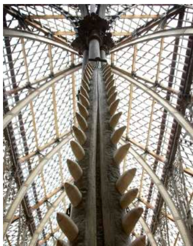
Sperm whale skeleton, University of Oxford Museum of Natural History.