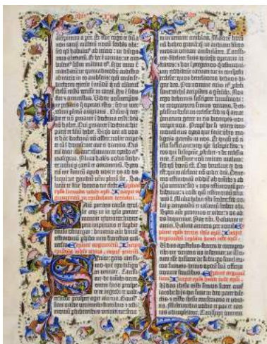
The Gutenberg Bible.

The collection is of national and international importance to the understanding of organised religion and the influence of the Church of England on the life of the nation.