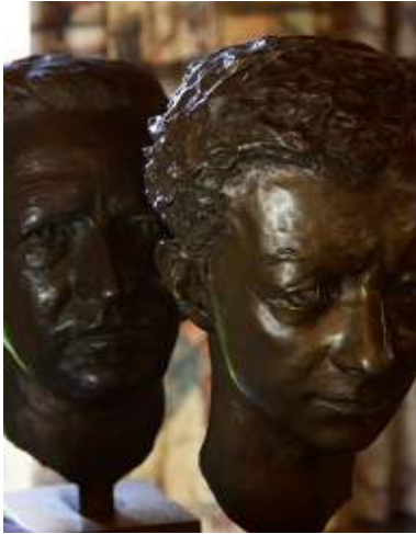
Sculptures of Britten and Pears.