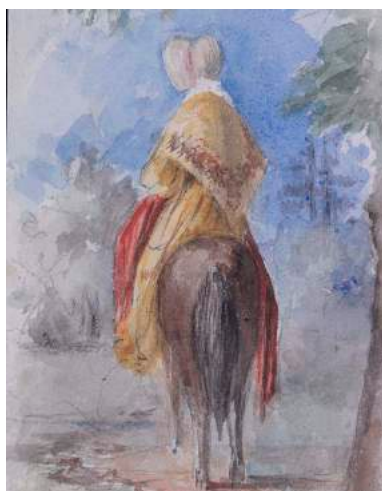
Watercolour sketch of Florence Nightingale and her pony, Peggy.

The archives at Cornwall Record Office are of outstanding historical, technological, cultural and economic value in evidencing the growth and decline of one of the South West's most important industries.