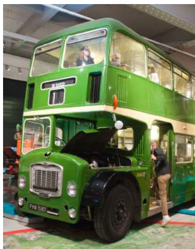
Bristol Lodekka Bus, Bristol City Museums.

Collections related to Bristol's role as a manufacturing city and major seaport