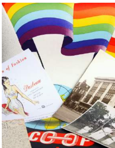
Archive material.

The Gallery of Costume holds one of the country's finest collections of clothing, textiles and fashion accessories. The collection consists of more than 21,000 items from the 17th century to the present day, including rare examples of the everyday dress of working people.