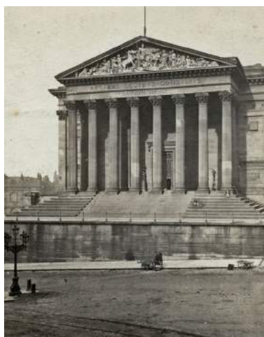
St George's Hall, pre 1900.

These museums trace the history of weaving and spinning through the displays of handlooms, power looms, flying shuttles, dobbies, jacquards, water frames, drop spindles and powerful spinning mules. Many contain original machines, and a number are still in working order and demonstrated on a regular basis. Queen Street Mill contains a unique collection of machinery which has been preserved in situ, including the original Lancashire boiler, the 500 horse power tandem compound steam engine 'Peace, the line shafting throughout the mill and the 19th century looms connected to it.