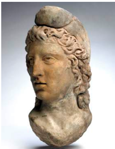
Marble head of Mithras.

The comprehensiveness of the Silver Studio collection makes it relevant both nationally and internationally for research covering subjects as broad as business and labour history, consumption of domestic furnishing, marketing and the history of studio practice.