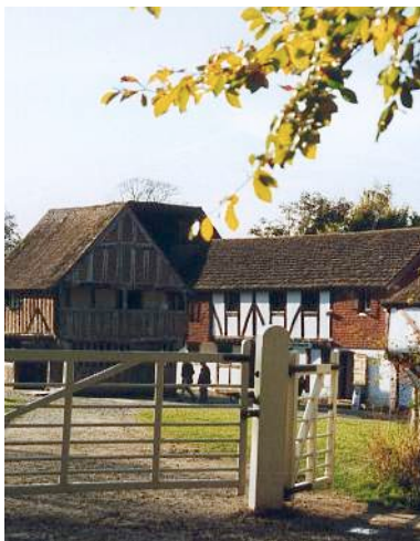
The Market Square, Weald and Downland Open Air Museum.

The museum offers an extensive programme of lifelong learning based on the collections.