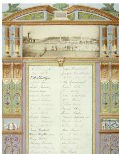
Presentation volume to George Melly, MP for Stoke on Trent, 1875, Staffordshire and Stoke on Trent Archive Service.

This collection also includes items concerned with the performance and study of his works from the 16th century to the present day. The collections comprise an outstandingly deep, rich and varied source for the study and enjoyment of all aspects of the life and works of one of the world's most celebrated literary and historical figures. The collections relate not only to Shakespeare and his works, but also to literary context, local history and the continuing evolution of theatre and performance.