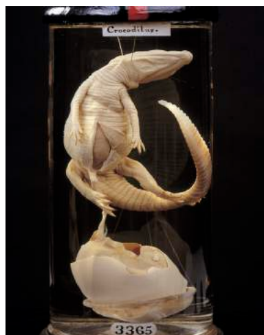
Crocodile and egg.

In the last 40 years, the museum acquired much of its holdings from field research targeted at areas not well represented in other UK collections. The museum has a programme of temporary exhibitions, education and loans to ensure that knowledge about its collections is readily available to the widest possible audience.