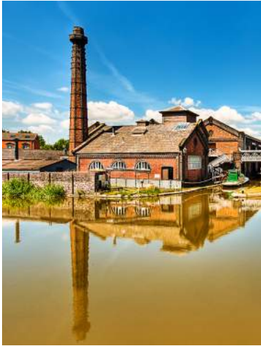
A view of the National Waterways Museum.