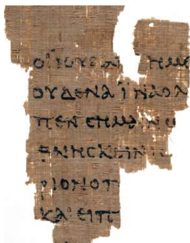
Fragment of St John's Gospel, c.200AD.

Arts and crafts design is well represented in both textiles and wallpapers, and the gallery has near-comprehensive holdings of Morris & Co. textiles. The fine art collections are particularly strong in works on paper and include important works by JMW Turner and William Blake. The 20th century drawing is well represented as well as a number of Pop Art works and prints by British artists.