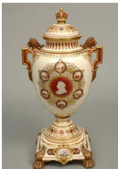
Lidded vase produced for Queen Victoria's Diamond Jubilee.

The Elton collection is one of the largest devoted to art and memorabilia on industrial subjects and complements a large volume of social history material. The Darby Collection includes the homes, furnaces, possessions and records of the ironmasters as well as fine Coalbrookdale castings and steam engines. The decorative arts material includes definitive collections of Coalport china and Maws tiles. The Gorge is a World Heritage Site.