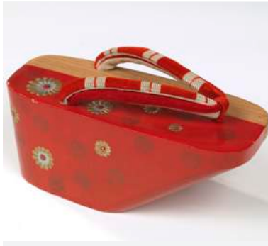
Geta sandal, Japan, 1963. .