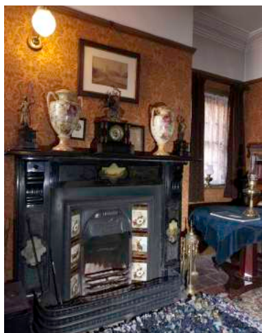
Locksmith's House parlour, Black Country Living Museum.

The Central Library has over 2 million photographic items and holds the only national collection of photography in a public library. It also holds over 6000 archive collections including many of national and international importance such as the archives of industrial innovators James Watt and Matthew Boulton; the Birmingham Shakespeare Library, which is one of the world's most comprehensive Shakespeare collections; a superb collection of war poetry; an excellent music collection; and a significant collection of Children's books and games. The Early and Fine Printing Collections incorporate over 8,200 books printed before 1701, 4,500 examples of fine printing, and outstanding hand-coloured illustrated books. The Birmingham Collection charts every aspect of Britain's second city, bringing together material available nowhere else.