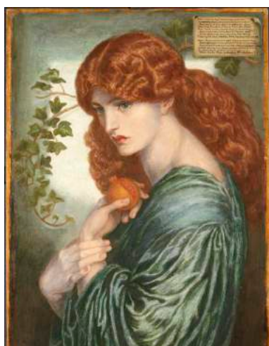
Proserpine, by Dante Gabriel Rossetti, 1882.

The Barber Institute also houses a rare collection of coins, seals and weights, chiefly from Rome, Byzantium and the Middle East.