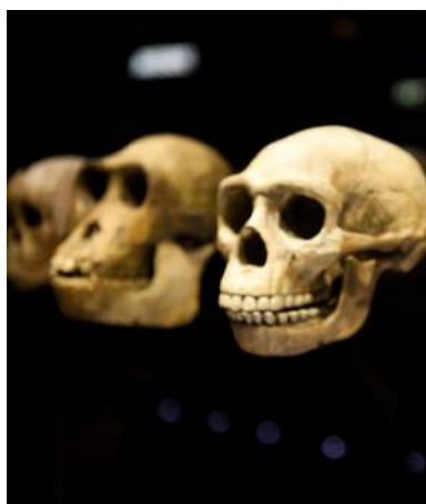
The Living Worlds gallery.

This collection reflects the global significance of the company and its predecessor companies. The comprehensive nature of the records held in the archive are considered to reflect Unilever's place in world trade, with the oldest document dating from 1295. Well-known branches of the Unilever company, such as Colman's, Wall's and Lipton, as well as brands such as Persil, Pears Soap, Lux, PG Tips and Marmite, all feature in the archive. The records include minute books, printed sources, financial records, advertising and examples of packaging, images and film, and architectural plans and maps.