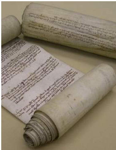
Two early episcopal rolls..

All of Wright's interests are represented in Derby's collection, ranging from scientific discovery and experimentation, industry and landscapes, through to literature, the classics and contemporary history.