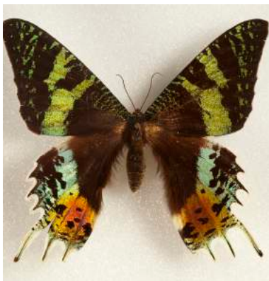
Madagascan Sunset Moth, University of Cambridge Museum of Zoology.

Important anthropological collections include artefacts from Cook's first voyage to the Pacific in 1769 and artefacts and photographs from the 1898 Cambridge Expedition to the Torres Strait.