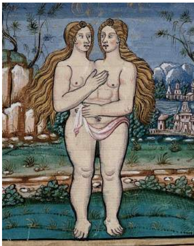
Illustration from Histoires Prodigieuses , showing 'monstrous' female twins, 1559.

Soane acquired, demolished and rebuilt three houses in Lincoln's Inn Fields between 1792 and 1837 to house his extensive collections. These include antiquities, paintings (by Canaletto, Hogarth, Turner and many early 19th century artists), furniture, architectural fragments, casts, architectural drawings, models, and much else, arranged in an 'inspirational' way in Soane's picturesque and 'poetic' interiors. All the collections of the Museum are Designated as, together with the house itself, they constitute a unique surviving example of an early private house museum.