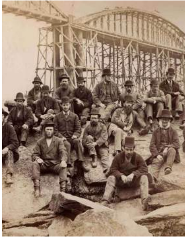
Photograph of the engineering staff on the Severn Railway Bridge, by George Keeling, 1870s. Photo: Institution of Civil Engineers.