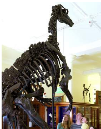
Iguanodon.