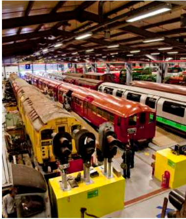
A view of the Museum.