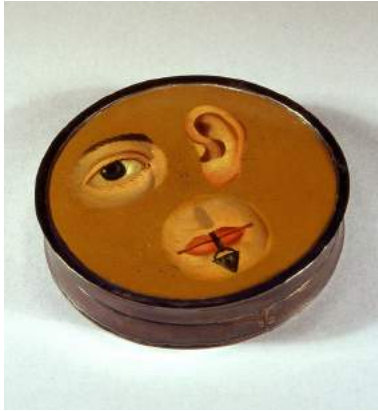
Papier-mache snuff box, 1846, Library and Museum of Freemasonry .