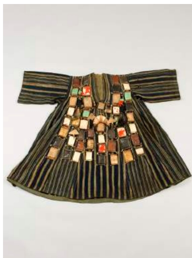
Asante batakari gown from Ghana.