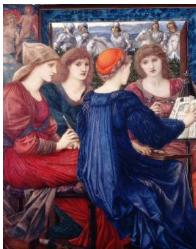
'Laus Veneris' by Edward Burne-Jones.

The Chinese collection is one of the most comprehensive in Europe. It is a significant and representative collection of pieces from earlier dynasties as well as numerous fine examples from later dynasties, and right up to the work of contemporary Chinese printmakers.