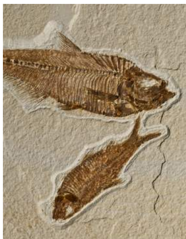
Fossil fish, University of Birmingham, Lapworth Museum of Geology.