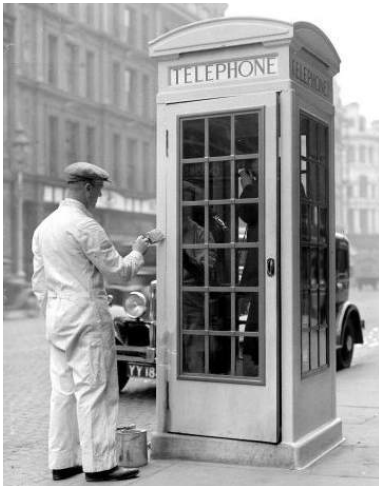
Archive material.

The Baring Archive is one of the finest archives of a financial institution anywhere in the world and is a vital resource for England's economic and business history. The archive contains material from the establishment in 1762 of the London merchant house of John & Francis Baring & Co, later known as Baring Brothers, right through to the firm's acquisition by ING in 1995. The firm's business was international from the outset of the company, with clients based in all the major international trading centres. Correspondence received from overseas agents and stored in the archive provides graphic accounts of the economy, politics and society of innumerable countries.