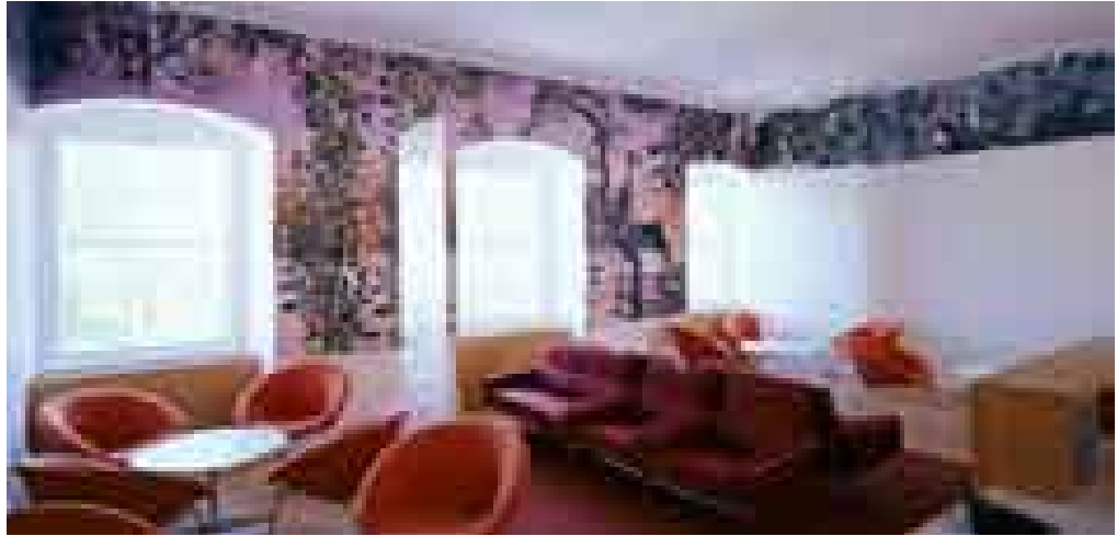
Twilight , 2004. Artist: James Aldridge. Commission: Vital Arts. (case study 9)