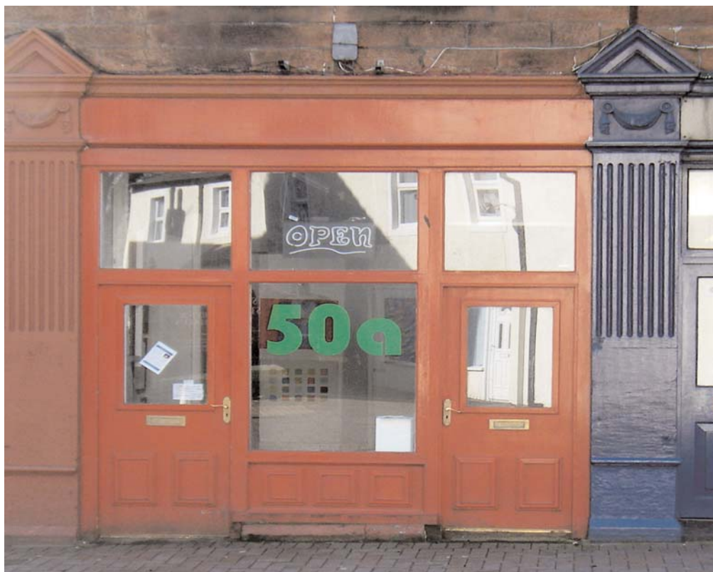
50a Gallery.

Creative Egremont, a partnership between Grizedale Arts and Egremont and Area Regeneration, delivers a diverse programme of arts and culture as part of the town's regeneration process.