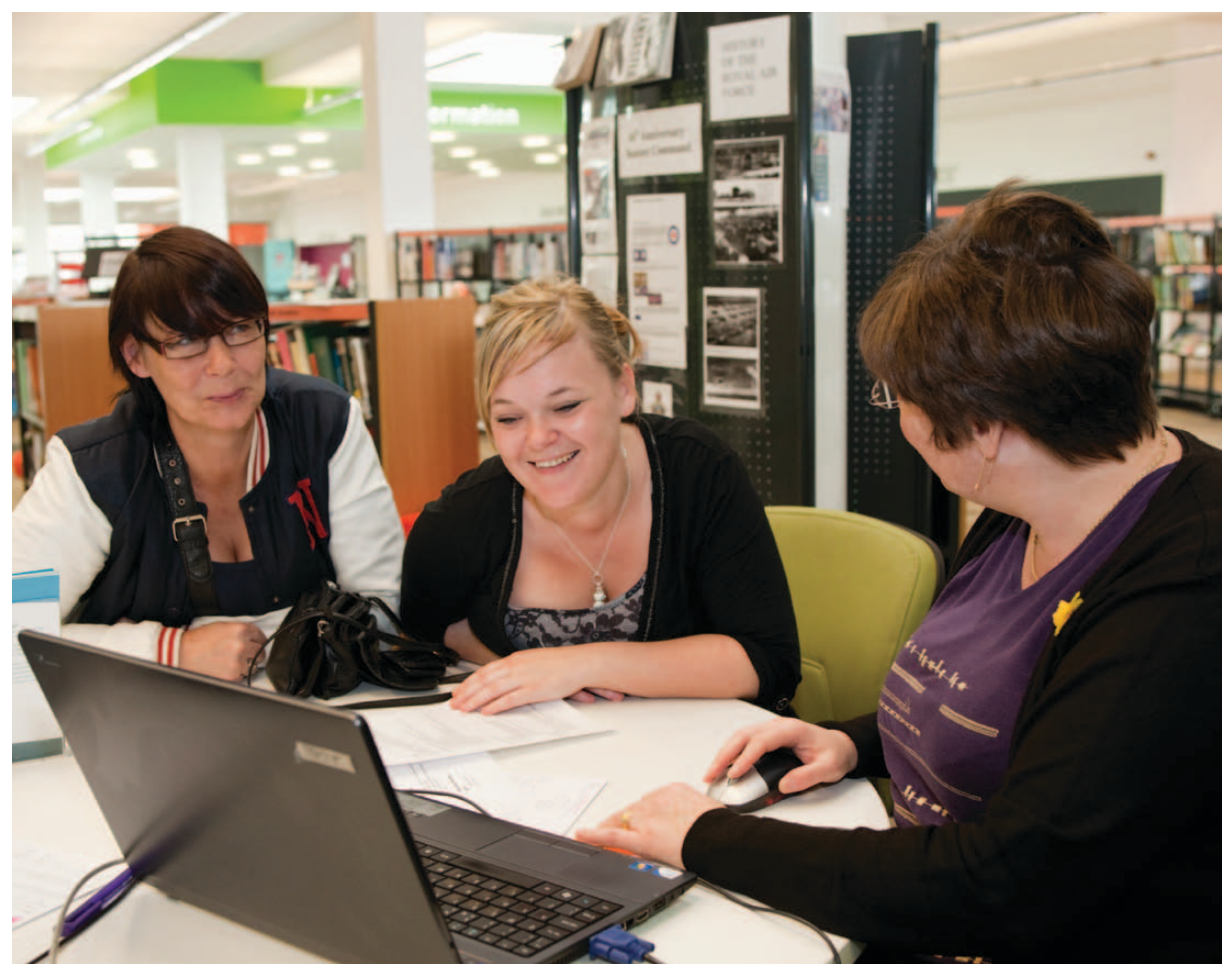
Library users at Chelmsley Wood Library, Solihull.

When asked to pinpoint the main purpose of libraries, respondents tended to look at the value of libraries to wider society. By enabling everyone to better themselves through reading, education, and the development of skills, libraries are a hallmark of a civilised and democratic society which respondents are proud to have as a public service.