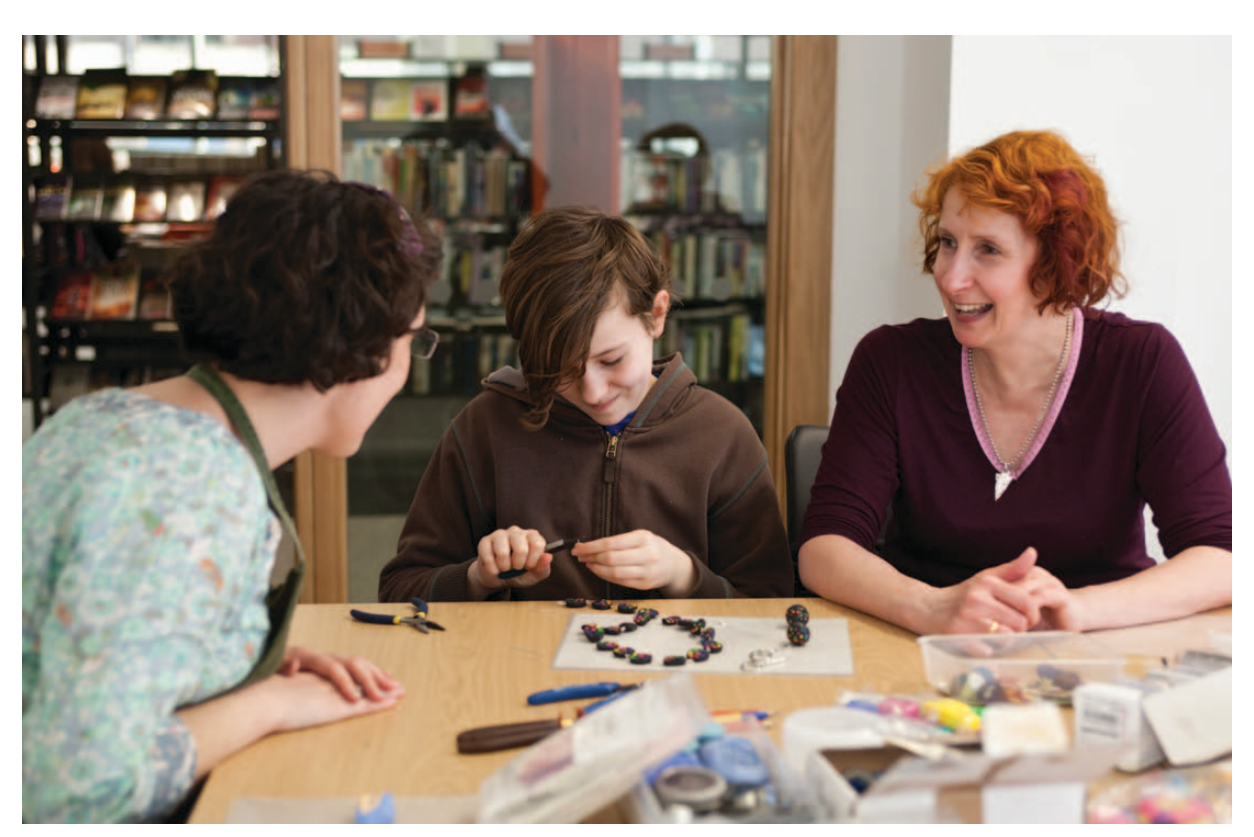
A craft session at Deptford Lounge Library, London.

'For those without access to internet services they provide a free opportunity to do so with assistance at hand when needed. This is particularly important for the 'digitally disadvantaged' as more and more government services move onto the web.'