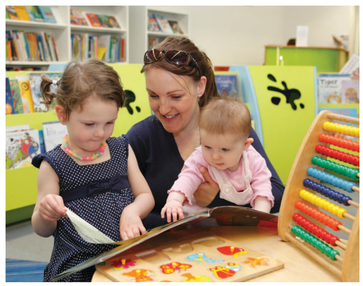
A young family enjoy the facilities at Hamworthy Library, Poole.

As libraries develop in the future, they will need to find new ways of providing the experience of discovery and exploration that nurture, enthuse and educate young people from their very first visit. For example, has exposure to interactive technologies designed for babies impacted on toddlers' responses to books? How are wider debates about the impact of technology on libraries played out within the context of services for children? The digital world may make the shared physical community space of the library only more important. The value of continuity and shared experience provided by public libraries can only be maintained by continuing to promote and develop the library experience for new generations of children.