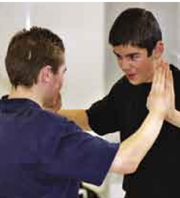
Left: Residency with Langley School and Reynolds Cross School, Blue Eyed Soul Dance Company