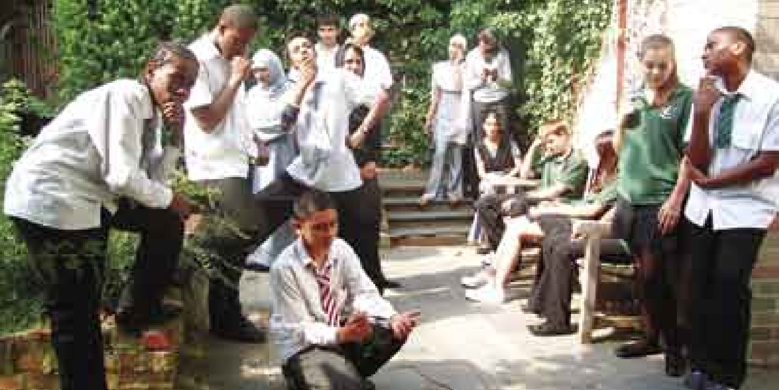
Above: Participants in Theatre Centre's Authentic Voices from Swanlea and Oaklands Schools