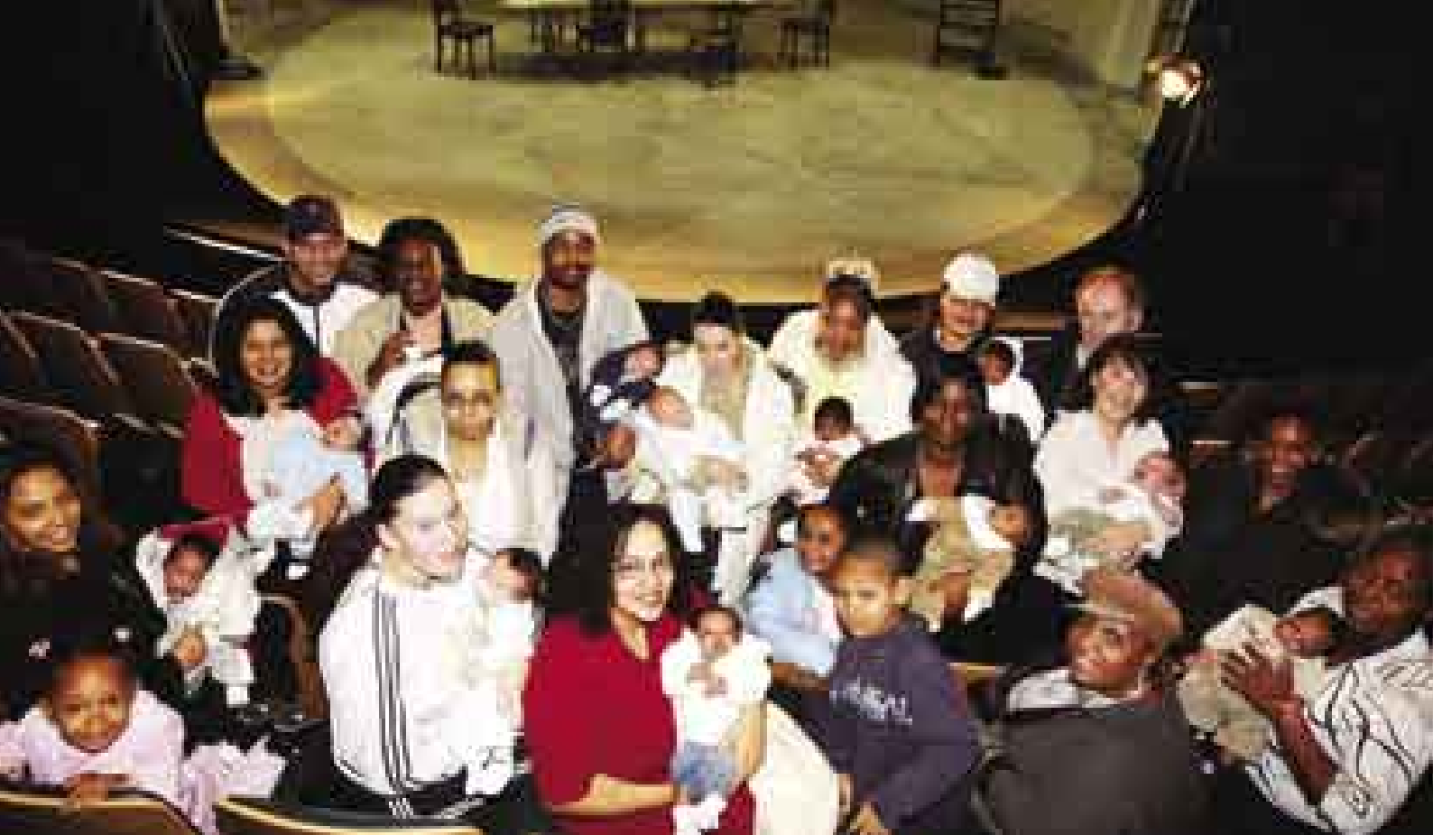
Above: REP's Children. Families and babies in the auditorium, Birmingham Repertory Theatre