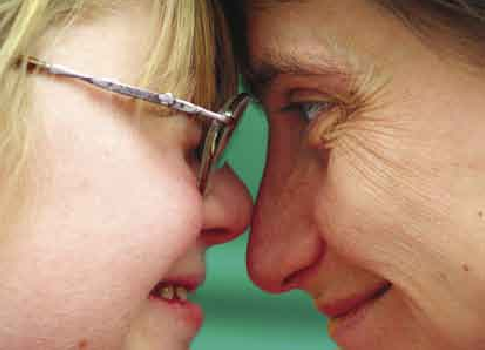
Above: TOUCH, Blue Eyed Soul Dance Company