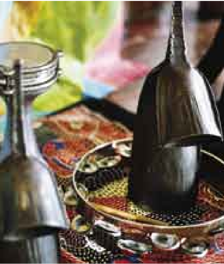
Above: Parlant Park Primary School, Sound Subjects, Music For Change