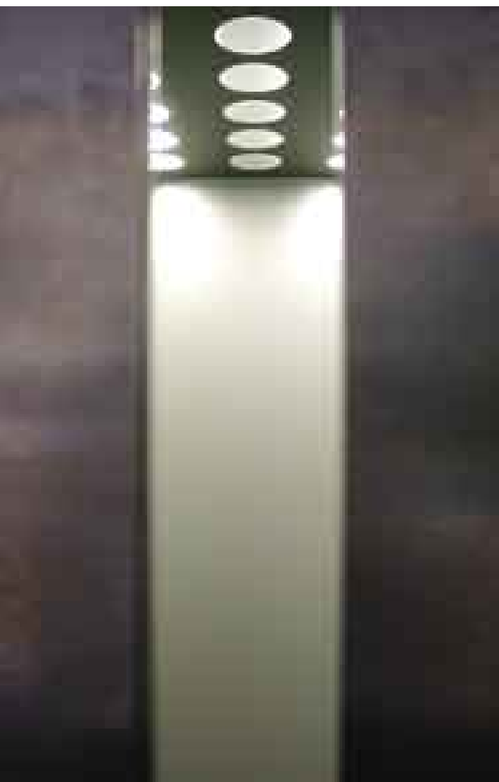
Left: In+Visible, Willingdon Community School