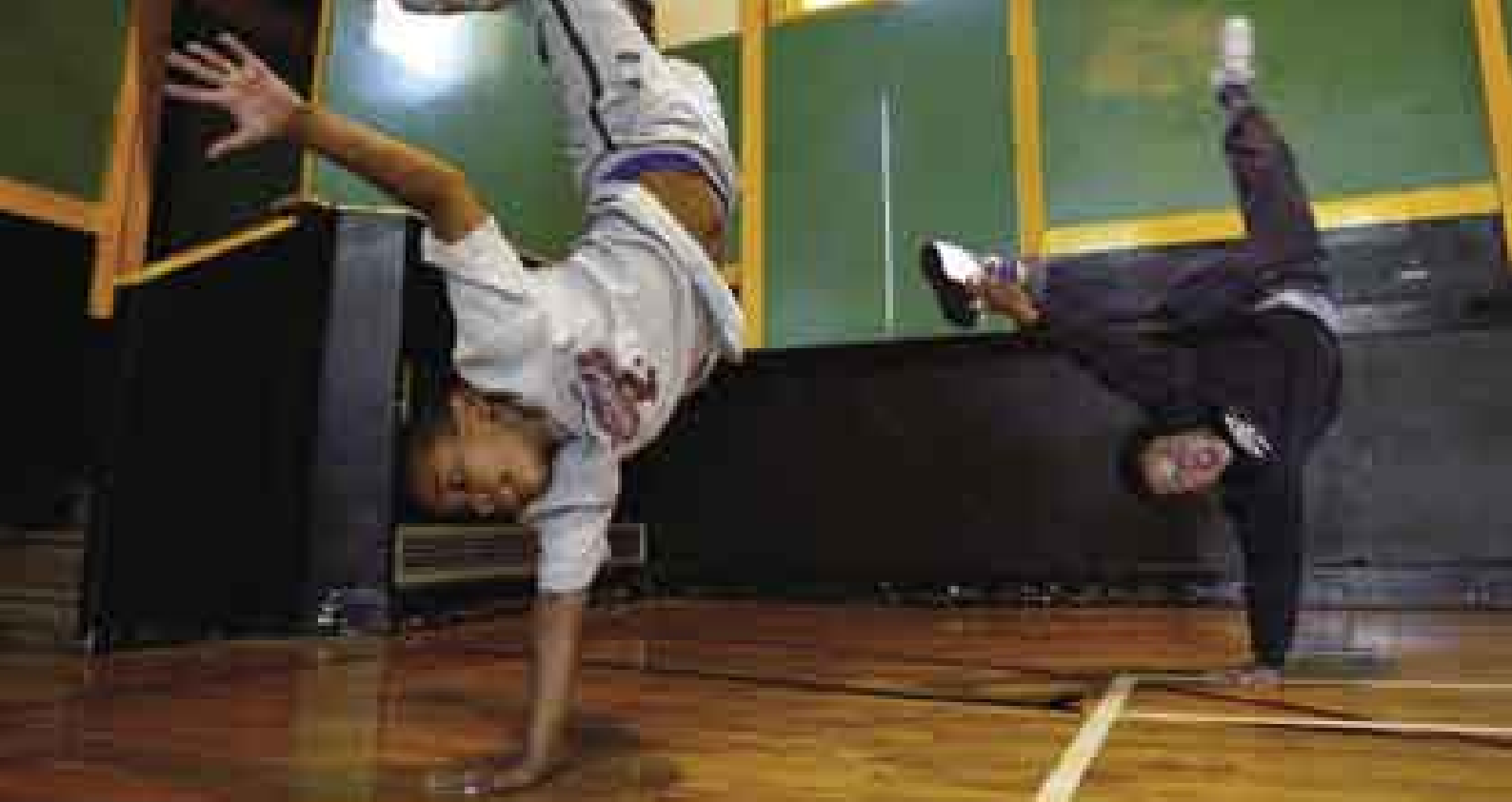
Above: The Hip Hop Happening (lead-up workshops), Derby Dance Centre