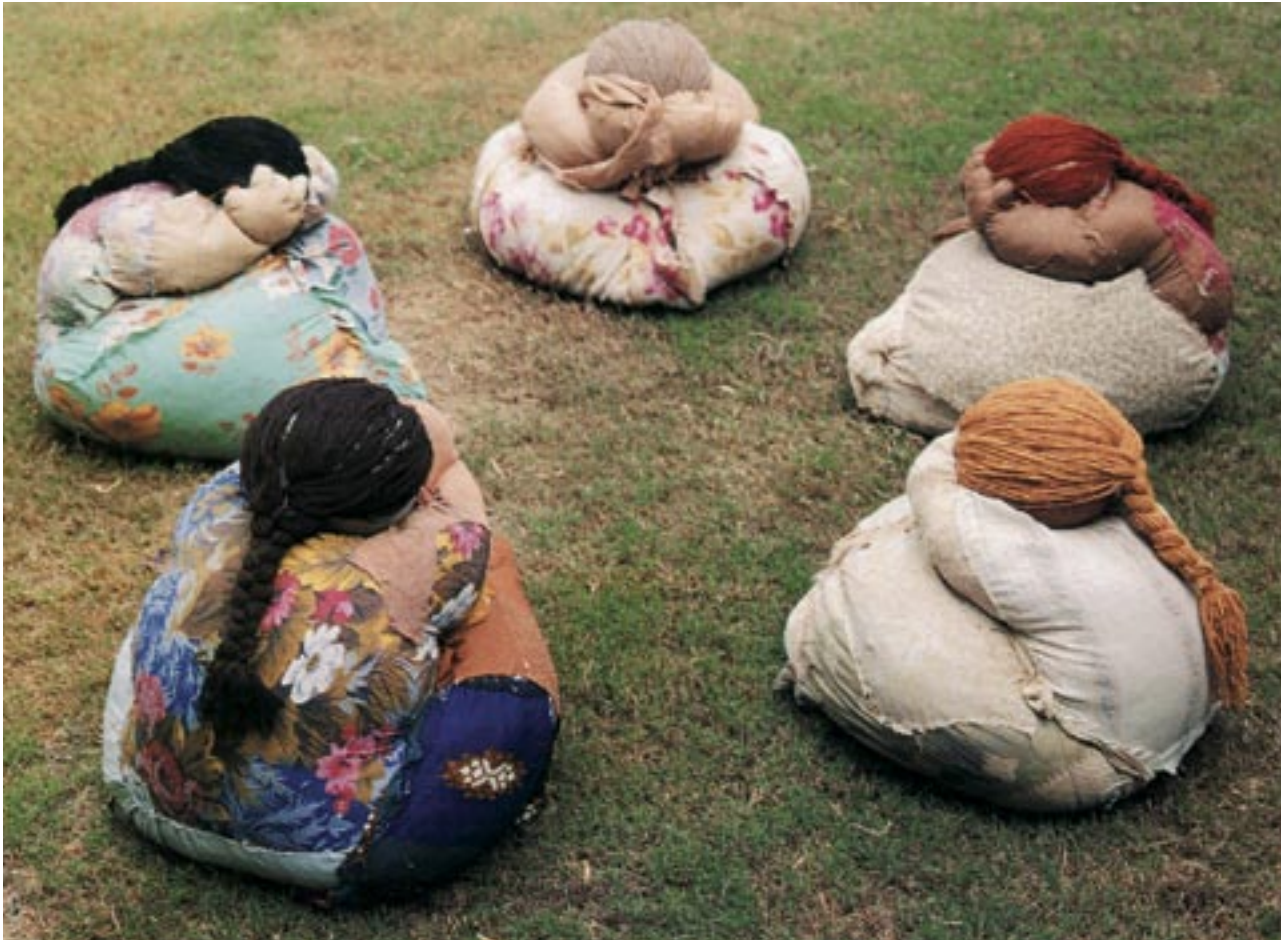
Image: My birth will take place a thousand times no matter how you celebrate it , by Ruby Chishti, 2000