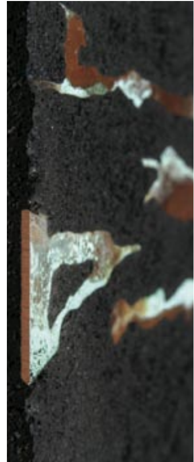
Images: (left) Phoenix II , charcoal and copper, from the series Phoenix by Donna Berry, 2003; (right) detail of Phoenix II